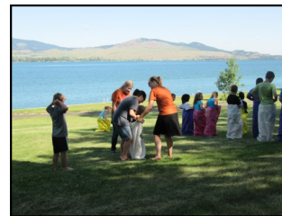
Kids eagerly line up for a sack race during Game Day at the Park — an annual Family Summer Reading Program activity

Usborne book fair, experienced “Kewl Science” physics demonstrations with Jim Semmelroth, and enjoyed Game Day in the park, with plenty