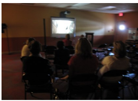
Attendees watch Silver Linings Playbook during our recent film/discussion series.