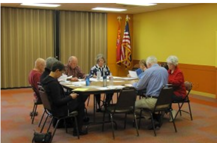
The North Lake County Library Foundation, intent on business.