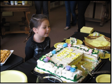
Young library patrons happily enjoy the punch and cake at our recent Open House!